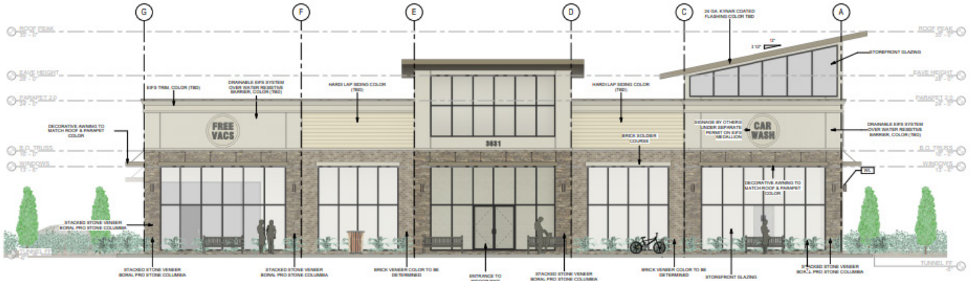
2 EAST FRONT ELEVATION (CLAIRMONT) 3/16" = 1'-0"