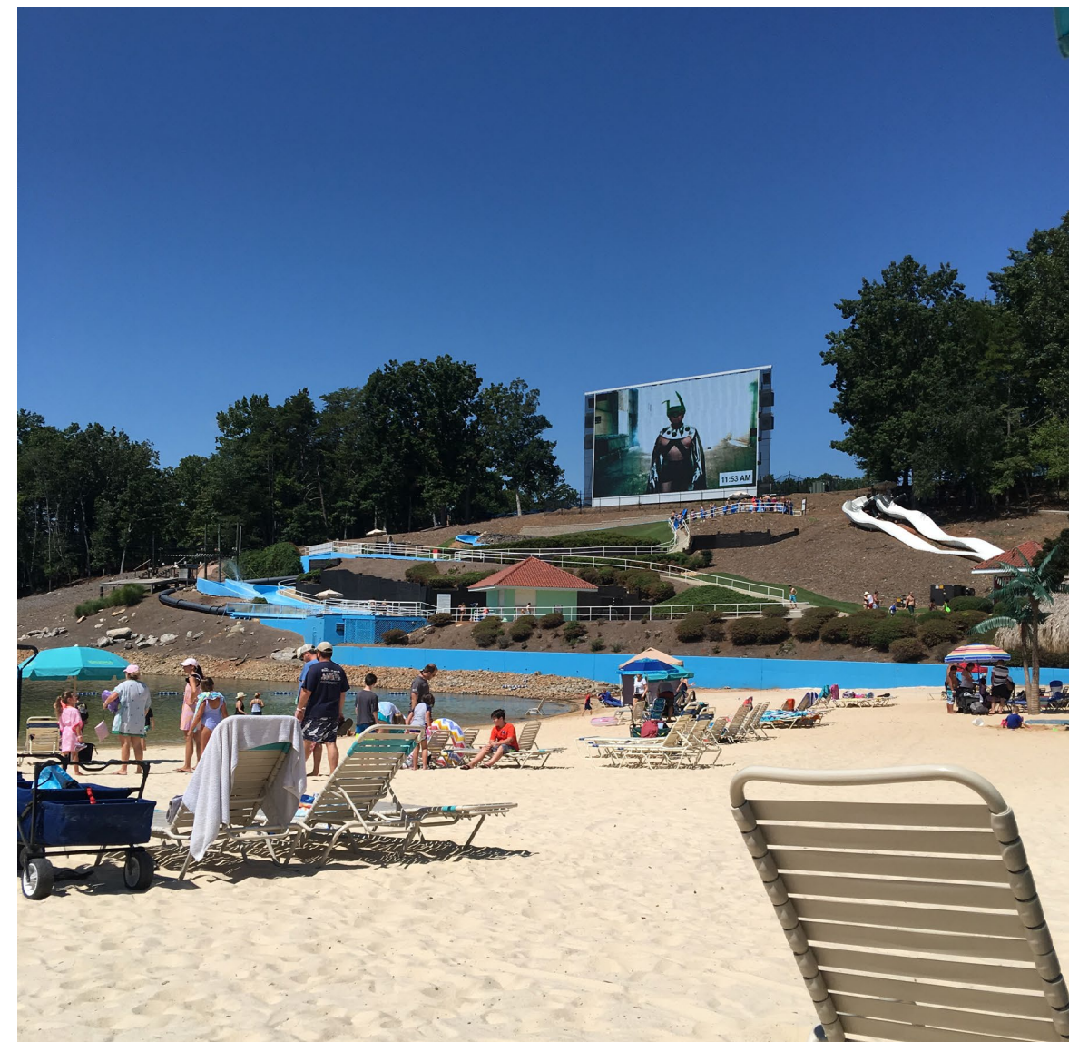
SUMMER PARTY AT LAKE LANIER