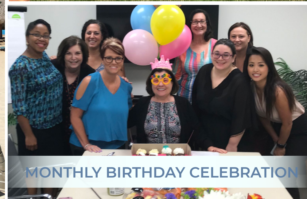
MONTHLY BIRTHDAY CELEBRATION