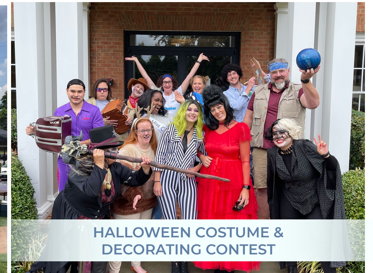
HALLOWEEN COSTUME & DECORATING CONTEST