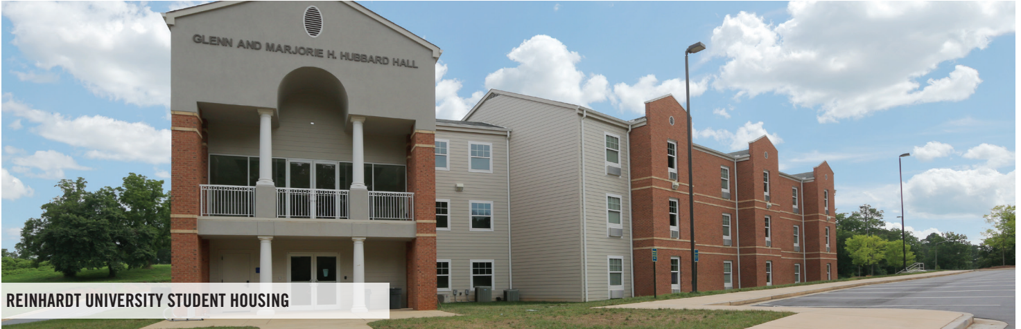
REINHARDT UNIVERSITY STUDENT HOUSING