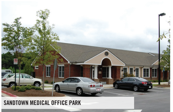
SANDTOWN MEDICAL OFFICE PARK