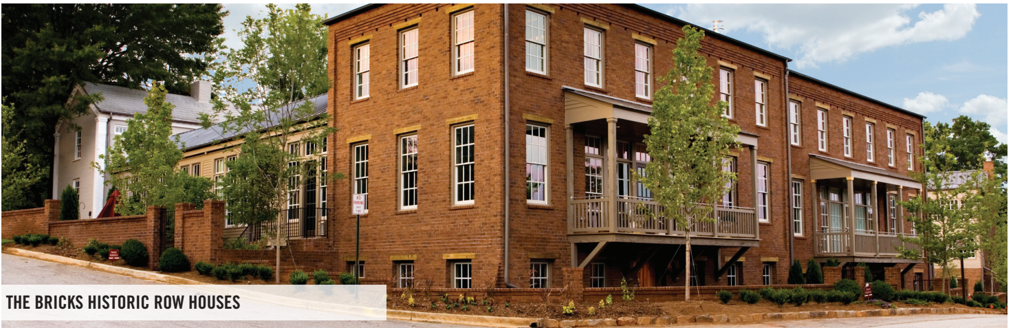
THE BRICKS HISTORIC ROW HOUSES