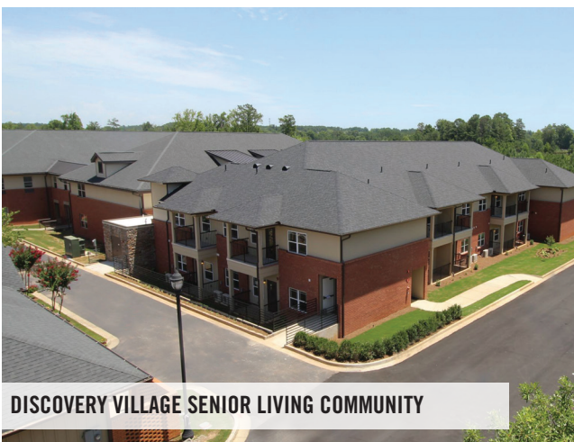
DISCOVERY VILLAGE SENIOR LIVING COMMUNITY