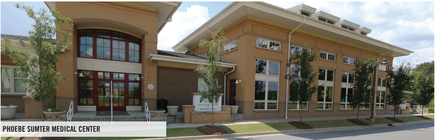
PHOEBE SUMTER MEDICAL CENTER