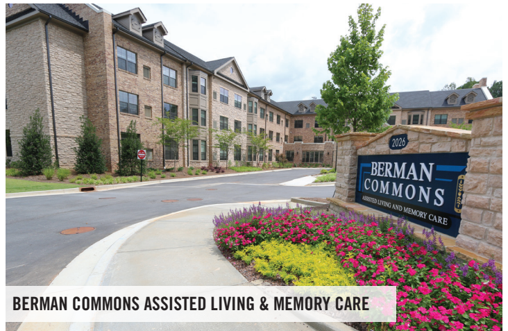
BERMAN COMMONS ASSISTED LIVING & MEMORY CARE