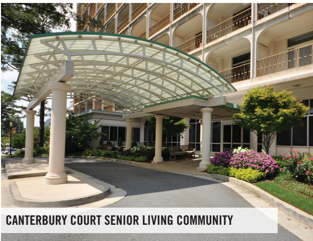
CANTERBURY COURT SENIOR LIVING COMMUNITY