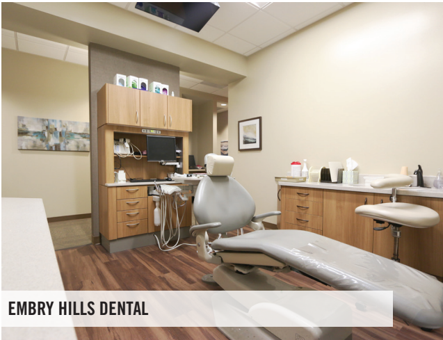
EMBRY HILLS DENTAL