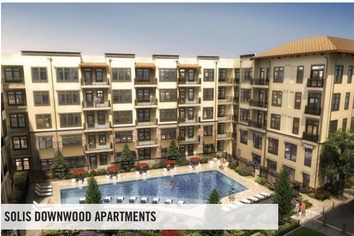
SOLIS DOWNWOOD APARTMENTS