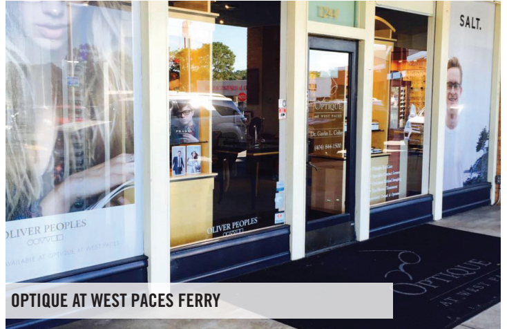
OPTIQUE AT WEST PACES FERRY