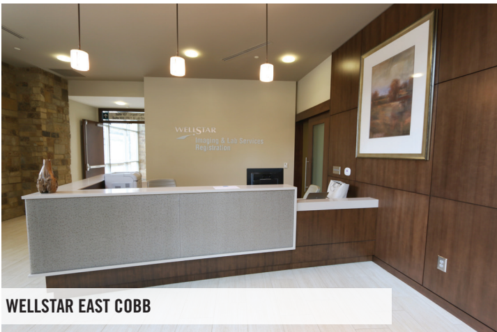
WELLSTAR EAST COBB