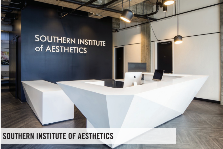
SOUTHERN INSTITUTE OF AESTHETICS