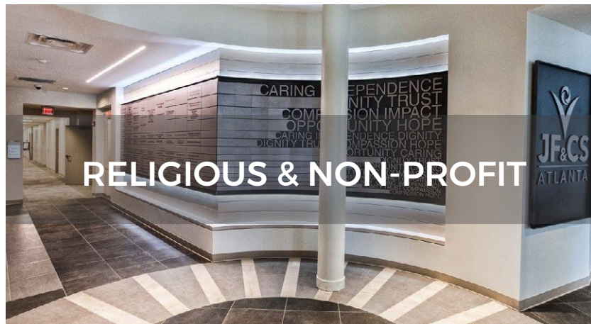
RELIGIOUS & NON-PROFIT