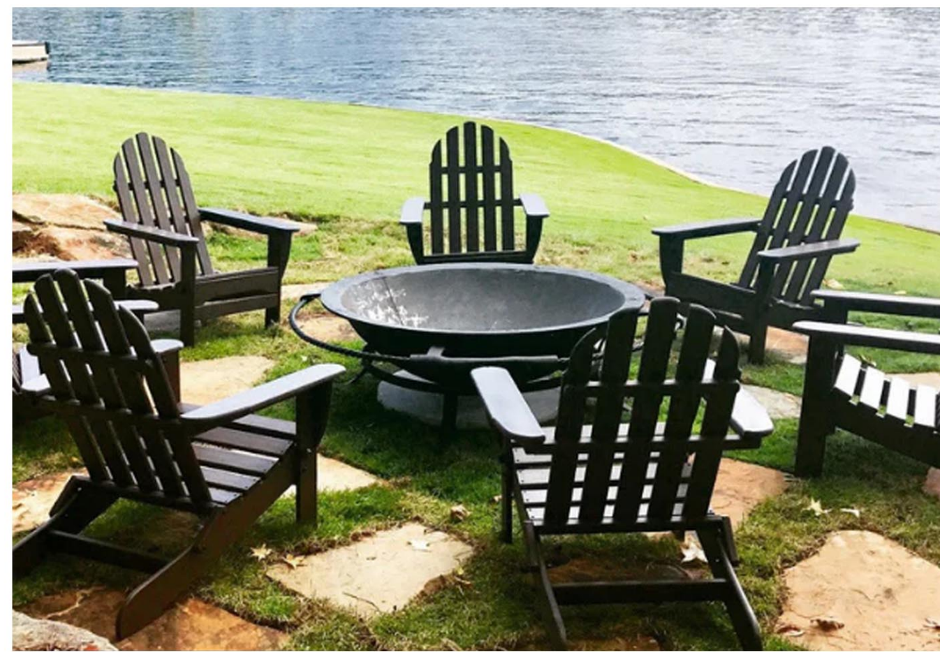
Fire kettle patio