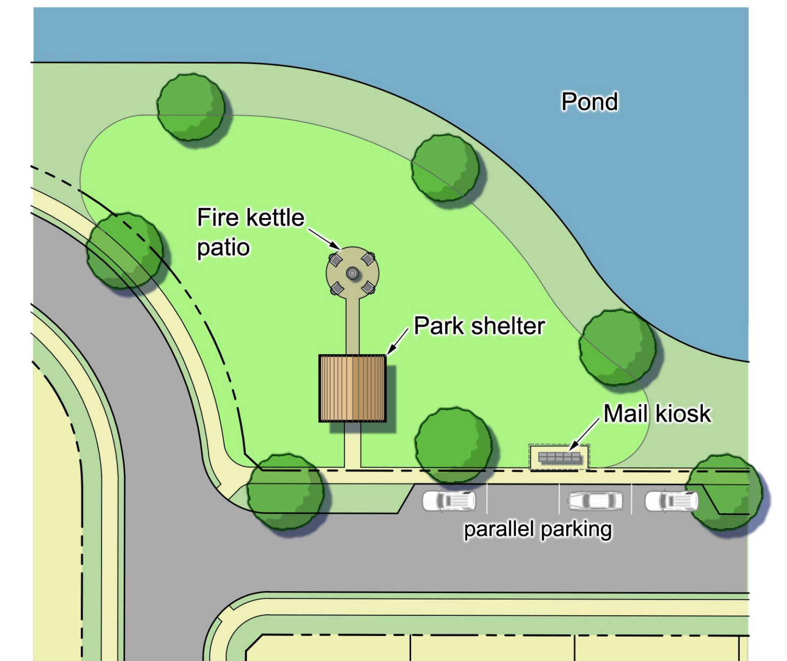
Amenity area enlargement